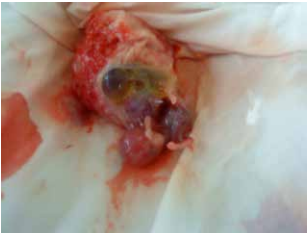
Fig. III Excise gestational sac with living foetus