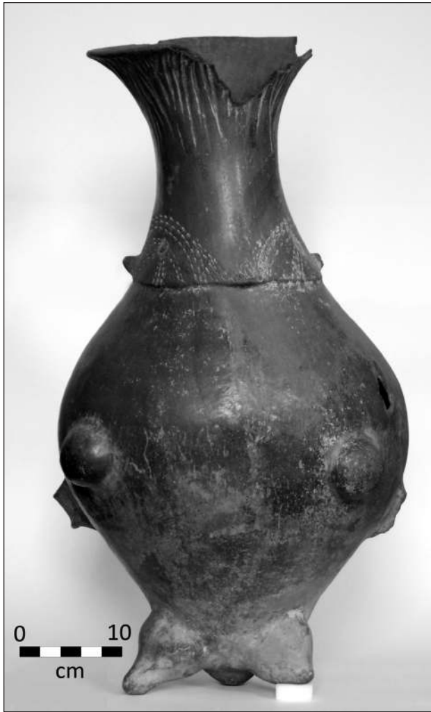
Figure 3. La Candelaria-style zoomorphic ceramic vessel. (Museo de La Universidad Nacional de Tucumán)

‘turbulent course’ below the separate surface of the bodies that separate species (e.g. Figs. 2–4; Viveiros de Castro 2007, 159). As such, an argument could be made that the vessels are the material embodiment of myth manifested through the establishment of a figurative art tradition, three-dimensional beliefs given greater force by their material permanence. However, analogical reasoning, while important for laying out the possibilities of different worlds, does not necessarily actualize the ontological potential of those worlds. The logic of the myths themselves, if treated as ‘the discourse of the Given’ (Wagner 1978, as cited in Viveiros de Castro 2008) rather than stories, also reveals the unlikelihood of the pots representing mythic events. If identity conceived as ‘disorganized bodies’ (Viveiros de Castro 2007, 158) is an ongoing state, a truth