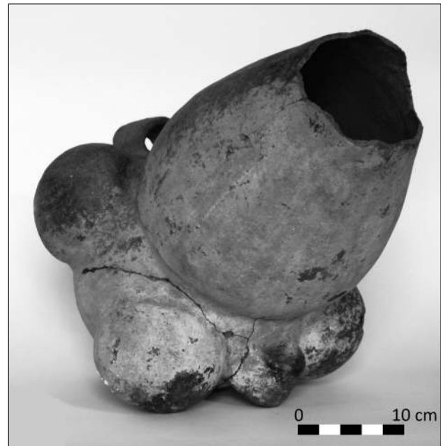
Figure 2. La Candelaria-style ceramic vessel showing biomorphic 'protrusions'. (Museo de La Universidad Nacional de Tucumán; photograph, B. Alberti.)

When faced with this body of material the immediate question is what does it mean? A conventional answer is that it represents the beliefs of past peoples. The task of archaeologists is then to re-construct more-or-less accurate interpretations of the underlying meanings inherent in the vessel forms and their imagery. Since the pots and their imagery fit within a generally Andean framework of beliefs, they are taken to indicate or to have been involved in ritual and other activities (e.g. DeMarrais 2007; González