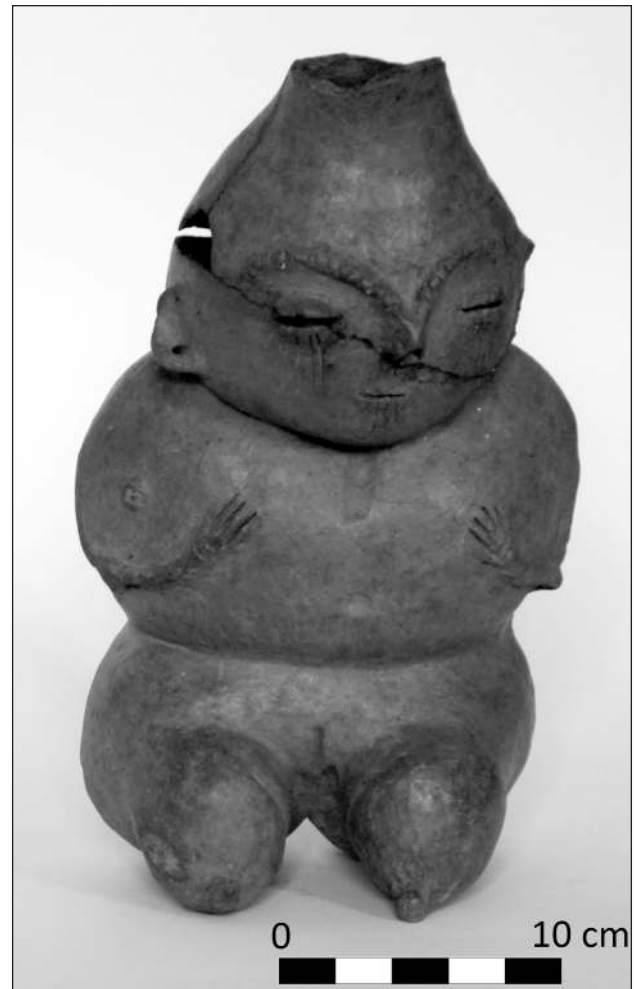
Figure 4. La Candelaria-style anthropomorphic body-pot. (Museo de la Universidad Nacional de Tucumán)

Working with the concept of the 'chronically unstable body' elaborated on the basis of the theories of the northwest Amazon group, the Wari', by Aparecida Vilaça (2005; see Conklin 2001), Alberti (2007) argued that the La Candelaria and San Francisco pots and skeletal material indicated a concern with 'shoring up' the body, preventing its transformation into another body with another point of view. Combining