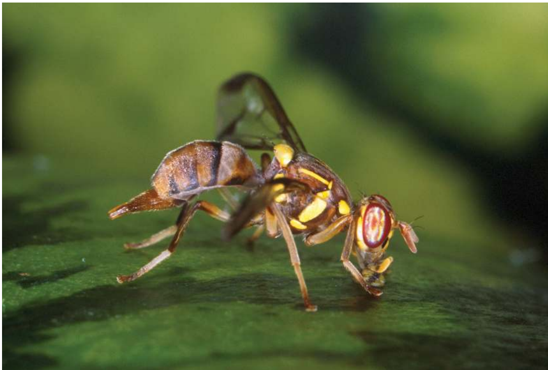
Figure 2. Adult female Bactrocera cucurbitae on watermelon fruit, Citrullus lanatus (Thunb.) Matsum. & Nakai.