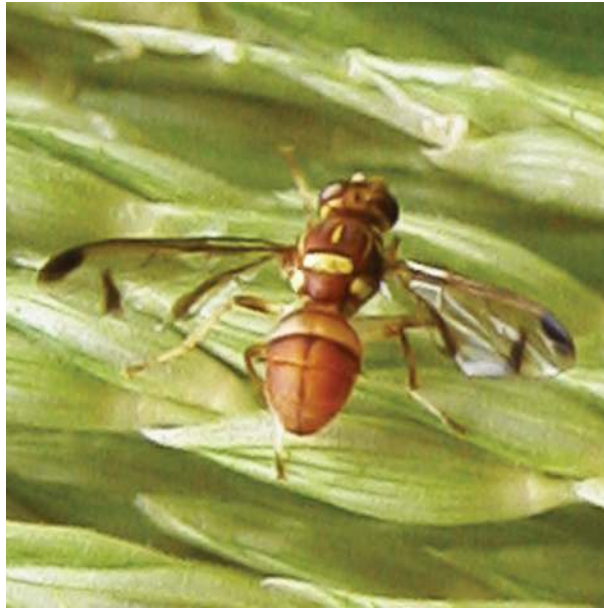
Figure 1. Adult male Bactrocera cucurbitae on a corn ( Zea mays L.) tassel, showing identifying features of black spot on the wing tip and a black band on the wing.