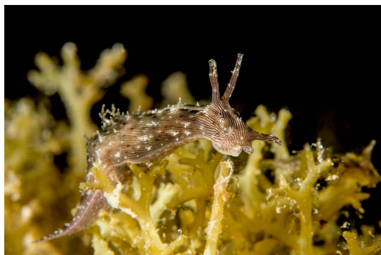
Figure 1 | Stylocheilus striatus , photograph courtesy of Fabien Michenet.

distribution as a specialist grazer on the toxic cyanobacterium, Lyngbya majuscula 14 . We examined whether developmental success (eggs completing organogenesis within five days of incubation), hatching (embryos hatching after five days of incubation), and survival after hatching were affected by repeated boat-noise exposure during early development in S. striatus . We predicted that development of embryos would be compromised by increased noise and that those that survived would take longer to hatch and have higher mortality after hatching.