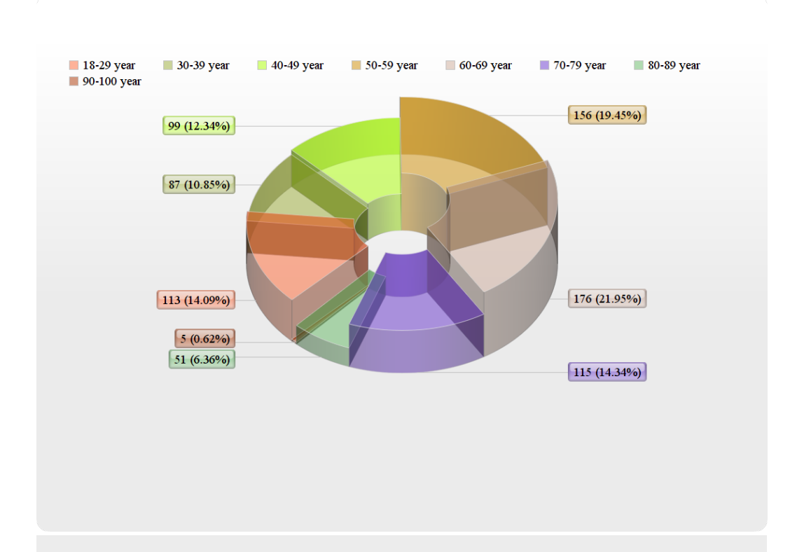
FIGURE 1: Age Distribution of Patients Admitted in the Intensive Care Unit

Of the total of 802 patients, 454/802 (56.6%) were males and 348/802 (43.3%) were females. Age distribution of patients admitted to the ICU is shown in Figure 1.