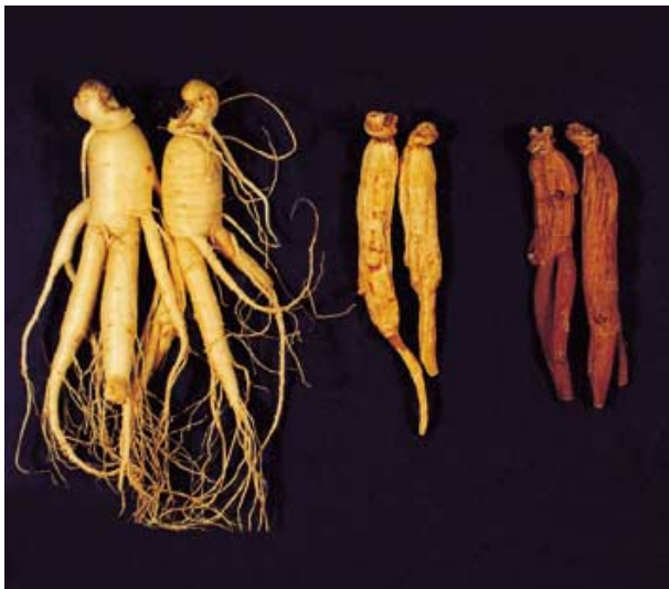
Fig. 1. Panax ginseng C.A. Meyer in Korea are classified into fresh ginseng (left), white ginseng (center) and red ginseng (right).

DMBA: 9,10-dimethyl-1,2-benzanthracene. *: p < 0.05