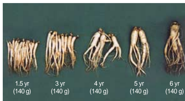
Fig. 3. Fresh state of Panax ginseng C.A. Meyer at 1.5, 3, 4, 5, and 6 yr.

Using Yun's model, investigators earlier confirmed the anticarcinogenic effect of 6-yr-old red ginseng extract. In this model, we further investigated the anticarcinogenic effects of fresh or white ginsengs and their derivatives, and the dependency of their anticarcinogenic effects on types and ages of ginseng derivatives. Here, fresh ginseng of 1.5, 3, 4, 5, and 6 yr of age (Fig. 3) was dried at room temperature, finely powdered, and extracted 3 times in a water bath for 8 hr (yield of extract: 45%). White ginseng was also processed in the same way as fresh ginseng after removal of its cortex and fine root (yield of extract: 47%). For preparation of red ginseng, fresh ginseng was steamed, dried, and processed in the same way as fresh ginseng (yield of extract: 51%). Overall, dried fresh ginseng, red ginseng powders or extracts of 1.5, 3, 4, 5, and 6 yr of age, and white ginseng powders or extracts of 3, 4, 5, and 6 yr of age were used. These preparations at 5 mg/mL were orally administered at the weaning, and all the mice were sacrificed at the 9th week. The following results were obtained: 1) the incidence of BP-induced lung adenoma was 41.3%, however, its incidence was reduced in the group treated with the dried fresh ginseng powder. The incidence of lung adenoma induced by BP was reduced to 31.2%, 30.0%, 31.3%, 30.3 and 27.8% ( p < 0.05 ) after co-treatment with 1.5-, 3-, 4-, 5-, and 6-yr-old dried fresh ginseng powders, respectively. Thus, a statis-