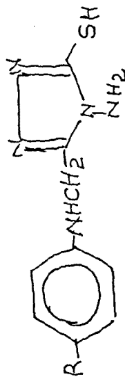
Table: Physical Data and Antiinflammatory activity of Triazoles 4A - F