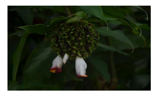
Plate 1. Costus lucanisianus

Biology, Federal University Otuoke, Bayelsa State, Nigeria.