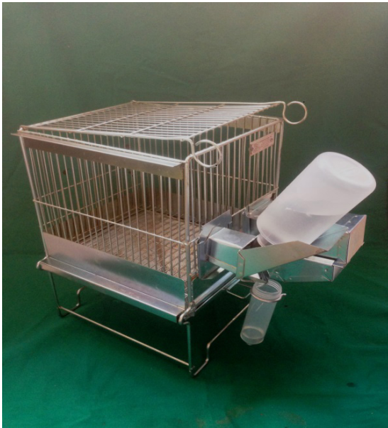
FIGURE 1 - Metabolic cage.

In the gavage period, we kept rats isolated in metabolic cages (Figure 1) in order to evaluate food ingestion. We also weighed the animals daily to quantify weight loss and food intake. This evaluation aimed to register the cachectic syndrome development in these rats.