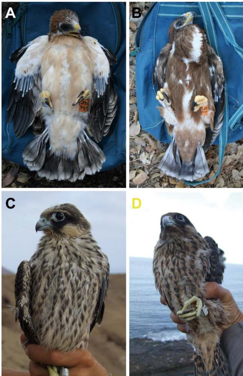
Figure 1. Booted eagle and Eleonora's falcon nestlings of different colour morphs. Examples of (A) light-morph and (B) melanic-morph booted eagle nestlings and of (C) light-morph and (D) melanic-morph Eleonara's falcon nestlings from the study populations. doi:10.1371/journal.pone.0013369.g001

6 mM 5,5'-Dithiobis(2-nitrobenzoic acid) (DTNB), and (III) 50 Units of glutathione reductase/mL. An aliquot (0.5 mL) of red blood cell homogenate was vortexed with 0.5 mL of 10% trichloroacetic acid for 5 seconds thrice within a 15 minute period. Between each vortexing the samples were placed in a darkened refrigerator to prevent oxidation. Finally, the mixture was centrifuged at 1125 g for 15 minutes at 6°C and the supernatant removed and placed on ice. Subsequent steps were carried out in an automated spectrophotometer (A25-Autoanalyzer; Biosystems SA, Barcelona). Solutions 1 and 2 were mixed at a ratio of 7:1 respectively and 160 \mu L of this mixture was added to 40 \mu L of the sample supernatant in a cuvette. After 15 seconds, 20 \mu L of