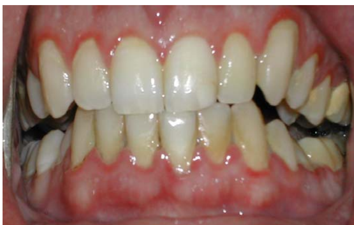
Fig 2. Gingival inflammation

* Multiple comparisons according to Bonferroni's method