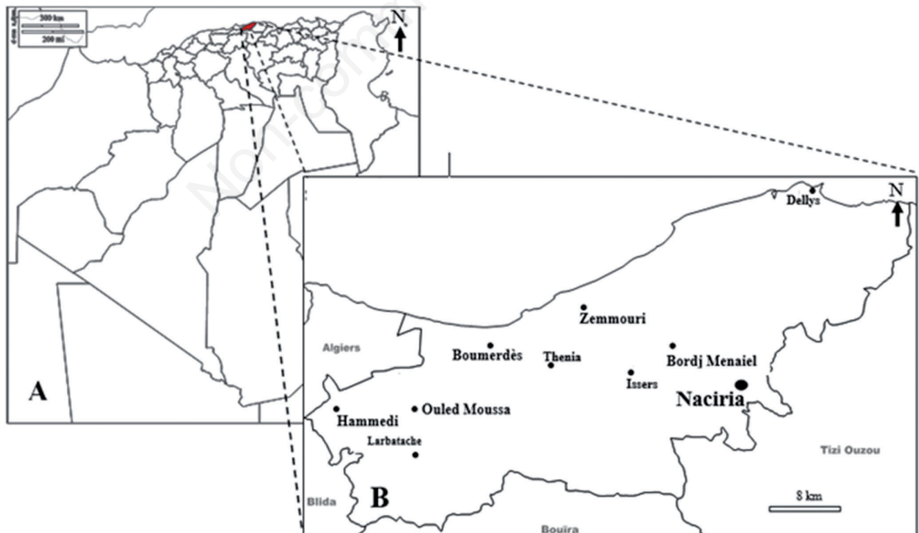
Figure 1. Map of Boumerdes region and location of study site, (A) Map of Algeria showing the study region, (B) the study region.

H' \text{ max.} is the index of maximum diversity expressed in bits, with H' \text{ max.} = H' / \log_2 S where S is the total richness corresponding to the number of species present.