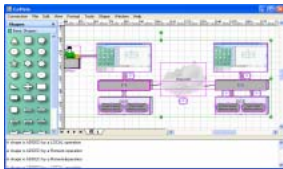
Figure 2. The CoVisio interface

CoVisio is built by extending single-user Microsoft Visio into a multi-user collaborative application, so that a group of users can use MS Visio to view and edit the same Visio documents at the same time from different sites. It is implemented in the programming language C# based on TA approach without knowing or modifying Visio source code. The interface of CoVisio is shown in figure 2.