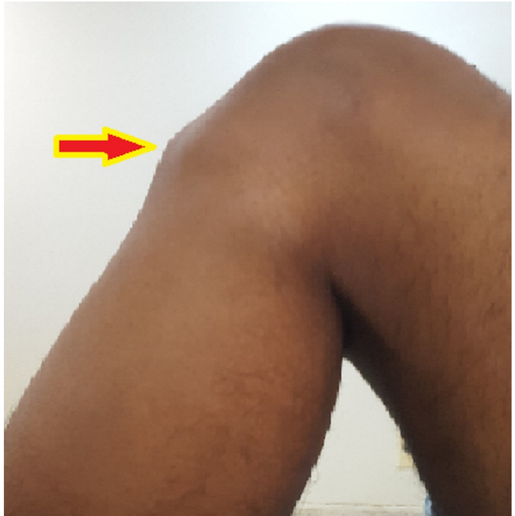
FIGURE 1: Bony prominence over the tibial tuberosity in OSD

Pain and swelling are the primary symptoms felt in the lower aspect of the knee, around the patellar attachment to the tibial tuberosity (Figure 1) [7-8].