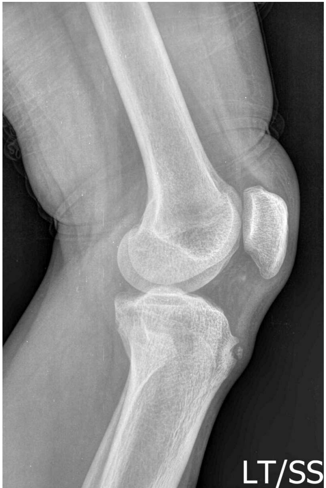
FIGURE 2: Separated ossicle and bony prominence seen in lateral radiography of knee in OSD.

Ultrasound may be useful as it determines any swelling in the soft tissue, cartilage, bursa, and tendon [9-10]. It also detects any new bone formation if present in the area. Magnetic resonance