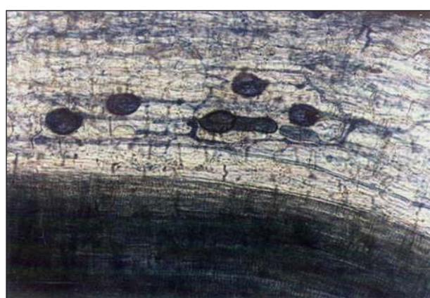
Fig. 2. Colonization of Glomus spp. sporocarps and mycelium hyphae on sesame root