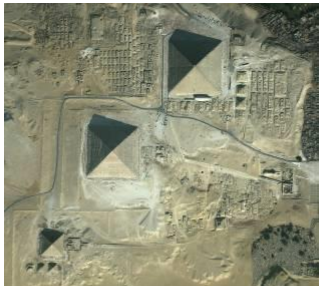
Fig. 1: Image captured by the satellite Quickbird.

surface surveys, displaying a considerable number of illegal excavations and other types of damage (investigations in the territory of Arpi sprang the recognition of 4000 tombs illegally excavated) bringing the total number of interventions to several thousand (Fig. 5-7).