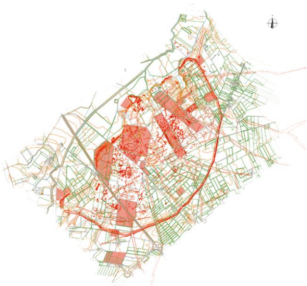
Fig. 8: Photogrammetric vectorization of Arpi's area with updating (red polygons) of archaeological sites damaged.

Again, the clandestine excavation, is not respectful of cultural periods at a previous times, now disregarded, without regulations or seasonal limits in these last years: for instance CEE norms to control the cereal production, ensured that highly productive fields, are left without cultivations, then available to illegal search (Mazzei 1995).