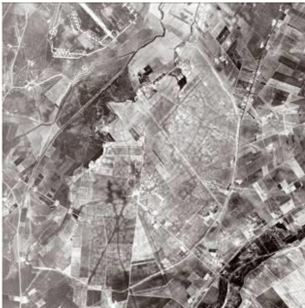
Fig. 6: At the top, historical aerial photo of the town of Arpi – Fig. (998 hectares), IGM 1954.

The happening of systematic abusive excavations and related clandestine commerce of ancient relics has assumed dimensions unknown hitherto; because of this, indeed, in recent decades, are been lost historical evidences of inestimable value (Zanker 1996).