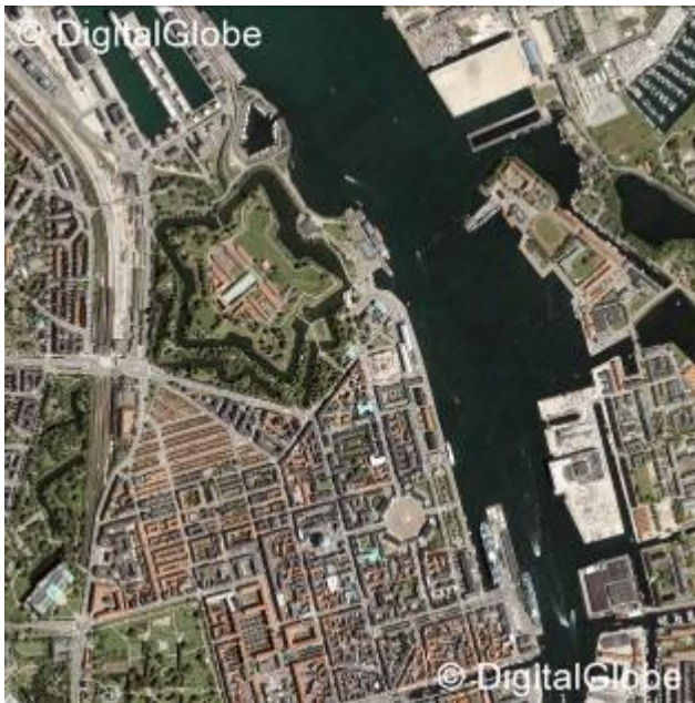
Fig. 2: Image captured by the satellite Quickbird.

clandestine excavations all over the regional territory.