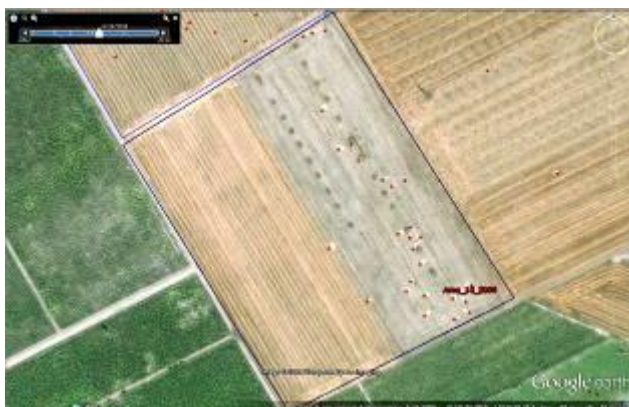
Fig.13: Illegal excavations in Arpi through Google Earth in 2007