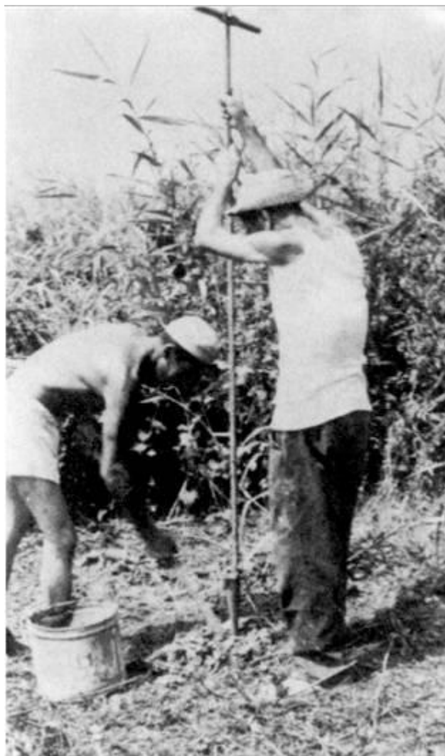
Fig. 15: Historical photo of robbery of tomb in Puglia.

Furthermore it should be noted the high potential of devices at remote command (drones) that, given their easy availability compared to traditional biposto or helicopters, could be used more frequently and with optimal results, for the monitoring programs and to keep control of areas considered at risk.