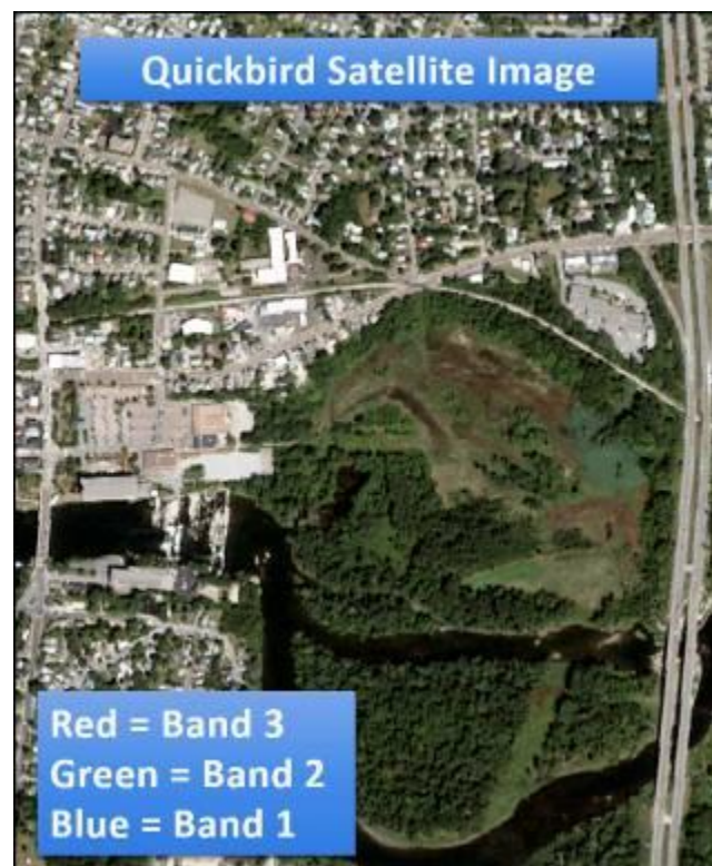
Fig. 3 - 4: Differences between Naip satellite images and QuickBird.