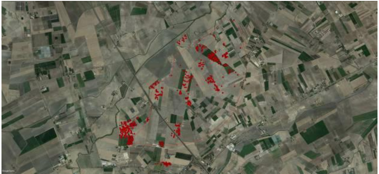
Fig. 11: Identification of illegal excavations in Arpi through Google Earth in 2013