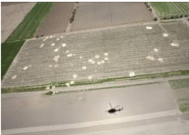
Fig. 9: Aerial photo (Carabinieri helicopter) with identification of illegal excavations in the territory of Arpi (ph. M., Guaitoli).

Again, the clandestine excavation, is not respectful of cultural periods at a previous times, now disregarded, without regulations or seasonal limits in these last years: for instance CEE norms to control the cereal production, ensured that highly productive fields, are left without cultivations, then available to illegal search (Mazzei 1995).