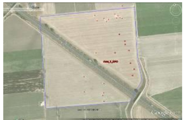
Fig.14: Illegal excavations in Arpi through Google Earth in 2007