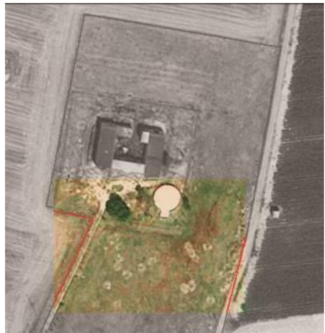
Fig. 10: Arpi: satellite image (Google Earth 2010) with highlight of any areas damaged by illegal excavations.

Consultation of satellites platforms open source has allowed a large scale monitoring on the Arpi's territory, in different periods.