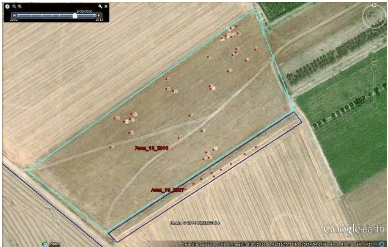
Fig. 12: Identification of illegal excavations in Arpi through Google Earth in 2010