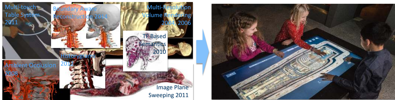
Figure 1: The visualization table developed at the Norrköping Visualization Center C, Linköping University, Sweden, is based on a progression of visualization papers over the past decade 2-9 (left hand side), integrated into an application that has impact both in the medical domain and is used in science communication. The image on the right hand side shows visitors to the Mediterranean Museum in Stockholm interacting with a combined surface and volumetric visualization of the mummy Neswau. A fuller account of this project has recently been published as a contributed article in the Communications of the ACM. 10 Papers of this kind provide valuable success stories to the visualization community showing how to combine and tailor the contributions of many technical VIS papers into a widely used system.

Integrating visualization techniques into a system—including work with application professionals, the combination and refinement of individual methods and detail work to create usable systems—requires large teams with dedicated researchers working at the interface between visualization and application. These researchers bridge the gap between fundamental visualization technology research and the grander vision of data understanding. Application papers document these efforts, providing valuable knowledge to peers on how to build these large scale systems. Furthermore, researchers at the interface between visualization and application science—who invest an immense effort in infrastructure-building and integration—need a clear career path, and in the traditional evaluation model this requires publications. Application-oriented papers are important for these researchers to earn recognition and to prosper in their careers. The success of these researchers in turn supports the field, demonstrating that innovation in newly developed methods can be used and will have an impact on real-world applications.