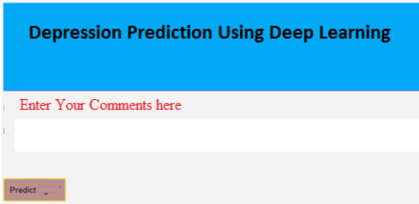
Fig.2 Front-end of the System