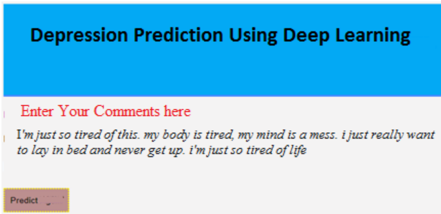
Fig. 3 User input to the system