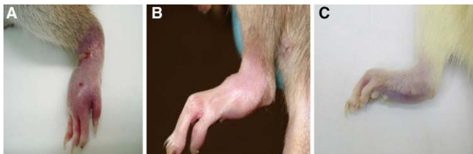
Fig. 2 Appearance of rat hind paws with arthritis following different doses of pristane. a Note swelling, redness and start of skin lesions. b Ankylosis at the chronic phase; histology shows active inflammation. The animals shown in a and b reached the humane endpoint and

The humane endpoints for each study will depend upon factors including its aims, the stage at which sufficient data are obtained, and sometimes whether a predetermined