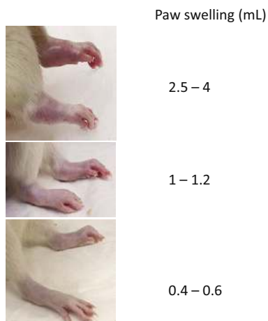
Fig. 1 Degrees of paw swelling in FCA adjuvant arthritic rats, measured using plethysmography. This illustrates significant, but well controlled, paw swelling to 2.5 mL. Volumes above this are likely to cause severe pain and debilitation and should be considered a humane end point, as in the top paw .

Infrared thermography (using a video camera) has been suggested to monitor clinical severity, as foot temperature