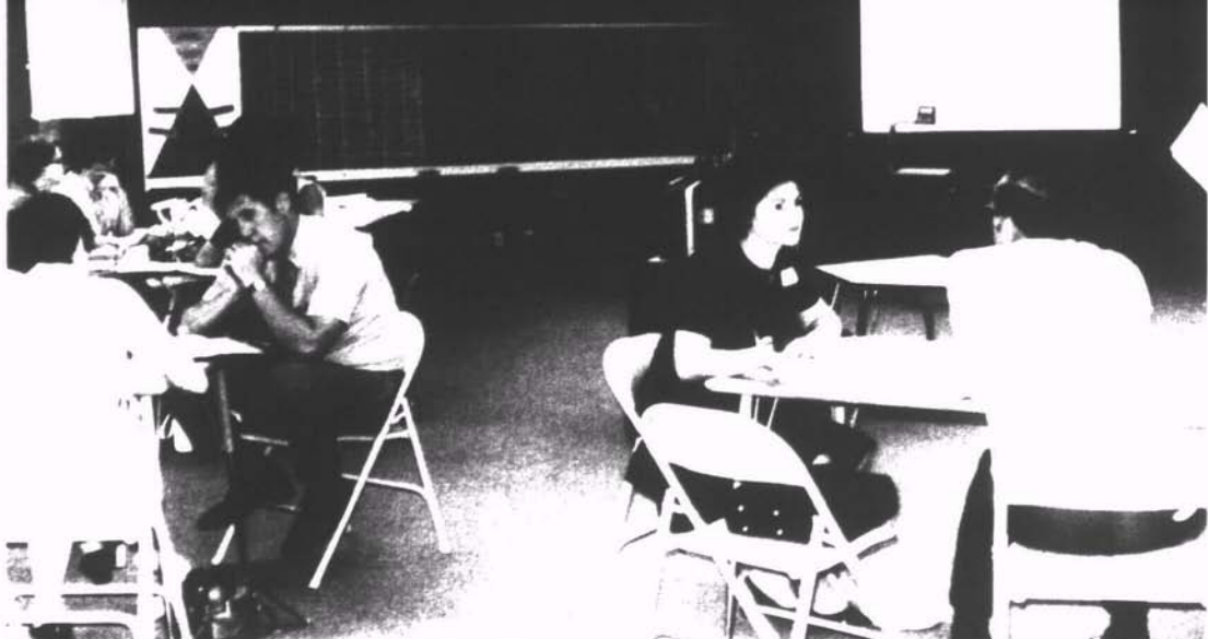
"No system can be expected to survive unless all participants have a voice in the method and the instruments that might be used in the process." Teachers above participate in the IOTA program setting up guidelines for appraisal.

• What training and objectivity will be required so observers and teachers can agree upon collected data?