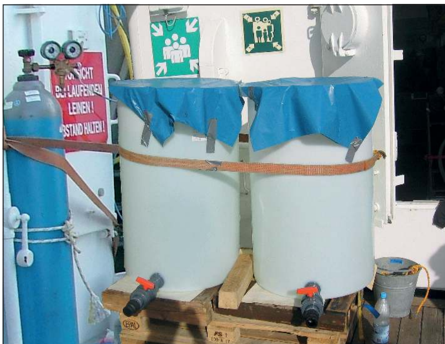
Figure 2.1 Aeration system for seawater carbon dioxide ( \text{CO}_2 ) enrichment consisting of a bottle of pure \text{CO}_2 gas and two 250 l seawater containers.