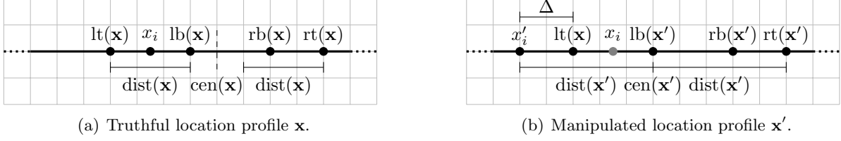
Figure 2: An Illustration of Subsubcase 2.1.1 in the proof of Theorem 3.5.

claim follows from the facts that cen(\mathbf{x}') < cen(\mathbf{x}) and rt(\mathbf{x}) = rt(\mathbf{x}') . If dist(\mathbf{x}) = lb(\mathbf{x}) - lt(\mathbf{x}) , with x_k located at lb(\mathbf{x}) , then the claim follows from the fact that both