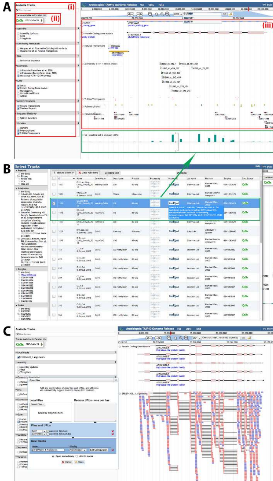
Figure 2. (A) (i) List of tracks available via the hierarchical track selector; (ii) a link to access the faceted track selector; (iii) track display panel showing the currently selected tracks for viewing (green inset: track chosen from the faceted selector). (B) Faceted track selector offers a search and filtering interface to enable choosing tracks based on the experiment metadata. (C) File upload capability ensures privacy to view one's own datasets alongside the Arabidopsis genome, and flexibility to work with large datasets such as short read alignments.