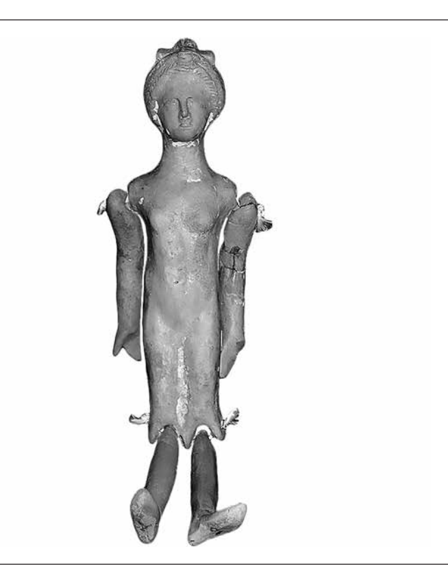
Fig. 4. Jointed doll from Attica, early fourth century in the private collection of Argyriadi, Benaki Toys Department, Phaliro, Athens. Sommer and Sommer (2015), 8, 11.

vases.<sup>25</sup> These dolls show no evidence of painted clothing; either the dolls remained naked or girls dressed them in miniature clothing. If the latter, the doll invited its owner to learn to sew attire as she dressed her toy. Images that appear on grave monuments bear scenes of girls in nurturing play—holding dolls as women held babies. For young girls, it seems obvious that one aspect of doll play was acting like and identifying with grown-ups and especially with mothers. That said, Greeks dolls themselves are never babies or even children, but mature women. We have no extant examples of male dolls, and this, perhaps, is a final indication of a fundamental connection between dolls and the social space and gender-awareness of women, both those who purchased dolls and those who played with them.<sup>26</sup>