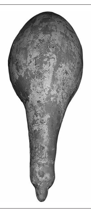
Figure 1. Club-shaped rattle from the classical period in the private collection of Argyriadi, Benaki Toys Department, Phaliro, Athens. Sommer and Sommer (2015), 7, 78.

same time, rattles, wheeled horses, and dolls potentially inform future comparative studies of toys from antiquity to modern times.