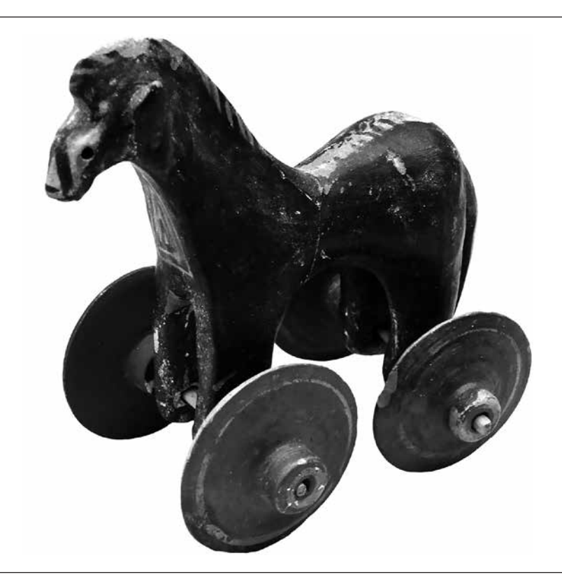
Fig. 3. Black-glazed wheeled horse from about 950 BCE in the Kerameikos Museum, Athens. Sommer and Sommer (2015), 9, 125.

that, even if someone else had given the object in question to a child, it was up to a child to choose to use it. Thus, recognizing the object as a toy and deciding to play with it was a child's decision.