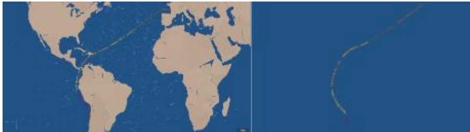
Fig. 2. Winnipeg captured in Conifer (l) vs ACT (r). In both cases, the coloured text remains dynamic, but in ACT, background images and additional moving text is lost.

The vast majority of Bitsy works captured well with ACT, despite functionality being primarily based around the use of arrow keys. As with other itch.io works, those with the auto run feature enabled did not capture with ACT, but captured successfully with Conifer. Only one work made with RPG Maker was found during the course of this study, but this also captured with ACT and retained full functionality including point-and-click and arrow key controls, although not without some technical problems. For example, skipping the title sequence sometimes causes a crash in the captured version. Increasing the capture limit in ACT seemed to improve the capture – the work was fully playable from beginning to end without error, even if the title sequence was skipped.