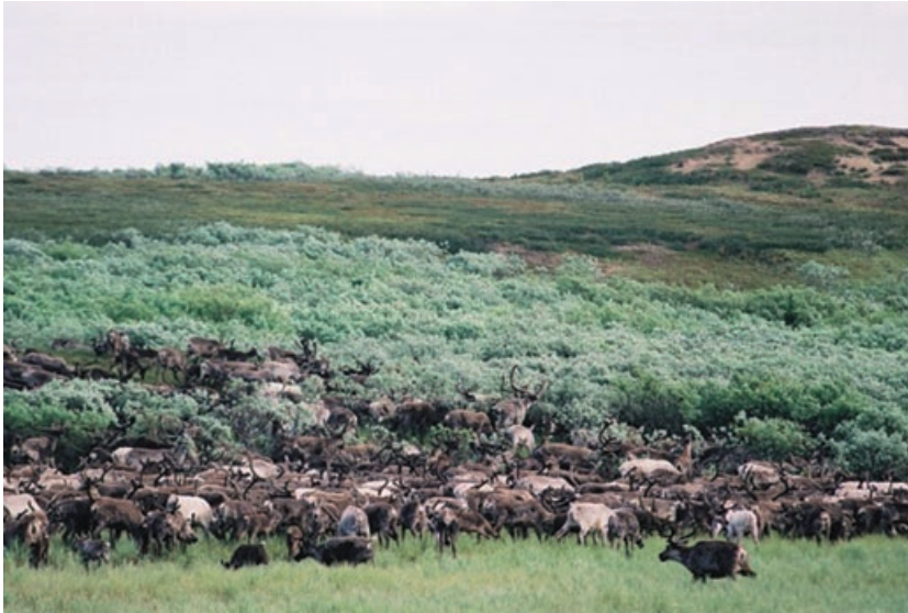
Fig. 2 Reindeer grazing among upright shrub willows ( Salix spp.) in the Nenets Autonomous Okrug. Nenets herders here and on Yamal Peninsula have reported that shrubs seem to have increased in height and abundance in recent decades. The tallest shrubs exceed the height of antlers of standing reindeer.

phenomena. Since 1998, Stammer (FMS) has engaged in intensive social anthropological fieldwork to understand the causes contributing to the widely perceived “success” of Yamal Nenets herders compared with their counterparts elsewhere in post-Soviet Russia. Extended to the European Nenets herders since 2003, this work allowed for ample opportunity to participate in and document day-to-day life through the different seasons, which happened to encompass some examples of what has come to be called “extreme weather”. One of the main findings of the BALANCE anthropological fieldwork was that climate change was not the main problem people were dealing with on a day-to-day basis, at a time where even basic needs could not be satisfied after the end of the Soviet Union (Rees et al. 2008). Herders had to spend all of their time and energy time to maintain their reindeer herds, and at the same time supply themselves with imported staples such as bread, tea and sugar, all of which had previously been dealt with by the all-caring Soviet state farm. Under such conditions, asking questions about climate change would have been answered by either laughter or silence.