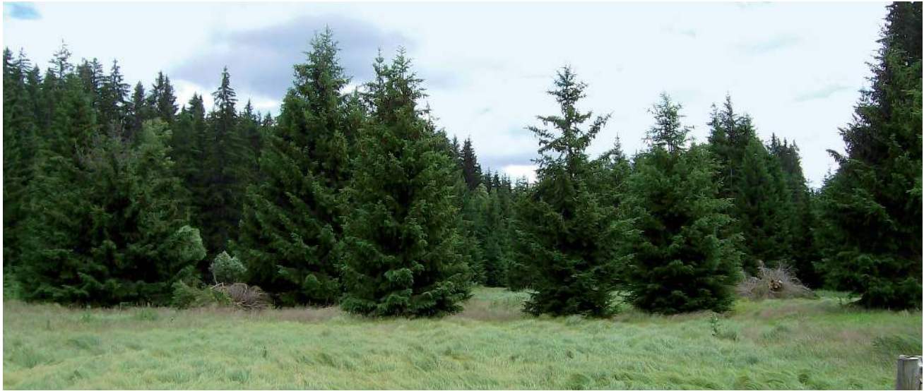
Fig. 2 Green forest without signs of damage in the unmanaged zone.

in the initial phases after the attack, before the massive re-growth of new trees occurs. But what about forest that has been clear cut to stop a bark beetle attack?