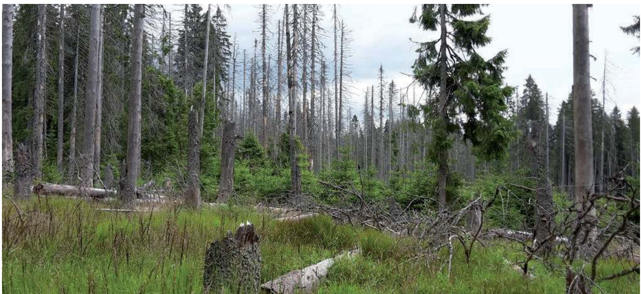
Fig. 3 "Grey" forest about 10 years after the bark beetle attack, in which natural regeneration of the forest is occurring (photo: K. Bílá).

ment area in the surroundings of Březník, which is in an unmanaged forest zone. In this area it is possible to determine whether floods and droughts are more likely where the forest is dead. The catchment area of Modravský potok includes three areas: one covered with green forest, one with dead forest and one with clearings and other land. The run-off from these areas was measured using a limnigraph above Modrava village and the amount of precipitation was obtained from a nearby meteorological station (Filipova Huť). The data for this study was collected from 1971–2015. Changes in the precipitation /run-off ratio would indicate that forest clearings have an effect. However, the annual run-off of the Modravský potok did not change (Hruška et al. 2016). The increase in run-off in March and April could have been caused by several factors (Hais et al. 2006). This could be partly due