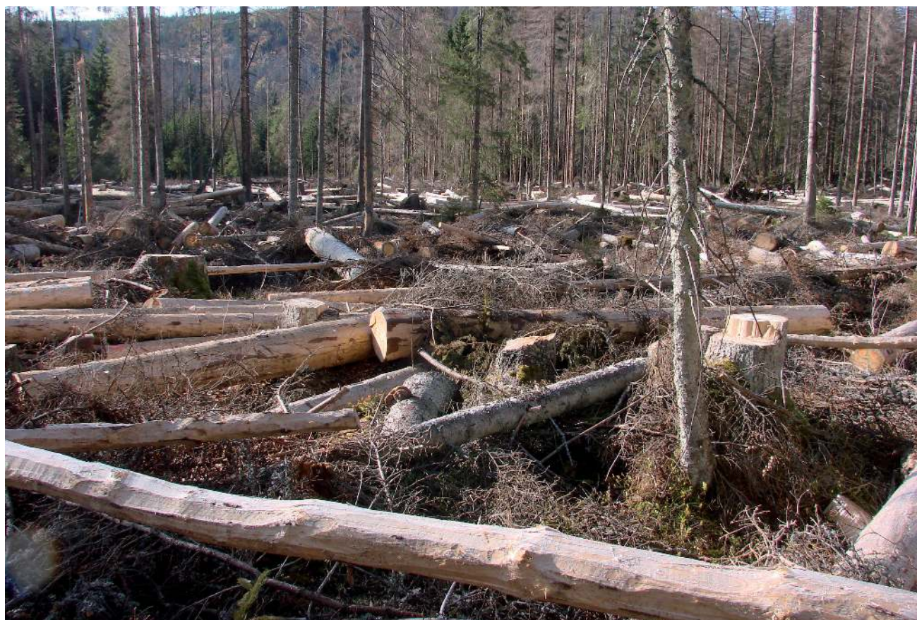
Fig. 4 Clear felling aimed at stopping the bark beetle from spreading.

to a change in the vegetation cover as snow in treeless landscapes or in forest without mature trees is not shaded and melts earlier. Furthermore, an evident air temperature increase causes an earlier snow melt in the Czech Republic and that's why the spring maximum run-offs shift from April/May to March/April in mountainous areas (Hruška et al. 2016).