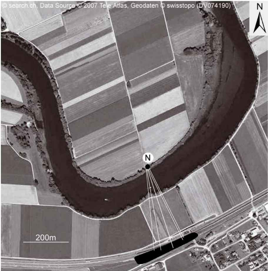
Figure 2. Area with open water and a motorway for the mark-recapture study with Hoplitis adunca in western Switzerland. The artificial nesting site close to the river is labelled with the letter N. The black area shows the Echium vulgare stand on the roof of an underpass covering half of the motorway. White lines indicate the foraging flights of the recaptured females.

for field crops in western Switzerland near Selzach, Solothurn (47° 11' 63" N, 7° 27' 78" E, elevation 420 m), which is crossed by the river Aare (Fig. 2).