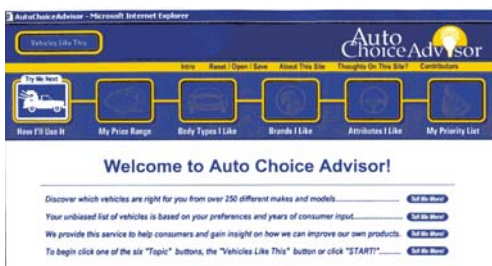
Figure 1 Site Designs

We focus on these critical managerial Web site design issues. Although most managers agree and understand that factors such as privacy and security affect consumer perceptions of trust in a Web site, they need a better understanding of how these other aspects of the Web site affect trust and the consequences of online navigation on the site affect consumers’