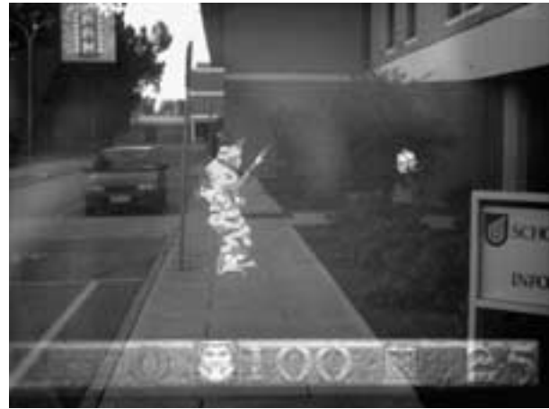
Figure 2: User’s Heads Up Display

The tracking of the user’s position and orientation of the user’s head handles the majority of the interaction