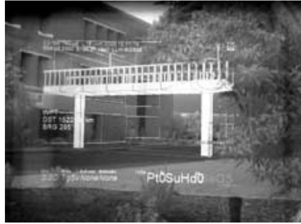
Figure 5: Proposal One Bridge

As a second application domain for the use of our outdoor AR system, we are investigating how to improve the visualisation of architecture designs. The first question to ask is – Why an architect may use this tool? An AR visualization tool will aid architects in conveying their ideas to their prospective clients. A common