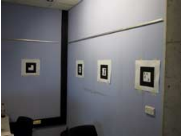
Figure 4: Fiducial marker on the wall

that they would be usable by the system regardless of whether the user was very close or very far from the wall. In this case, we chose to use patterns that were a size of 19\text{ cm}^2 . From testing, we found that the system could register a pattern at a range of 22.5\text{ cm} to 385\text{ cm} from the wall. In a 8 \times 7\text{ m} room this range would be sufficient (for the initial stages of the project) and an accuracy of within 10\text{ cm} at the longer distances. It is important that no matter where the user looks in the room that, at least one pattern must be visible in order to provide tracking. For this reason, we realised that to implement the patterns on the walls as the sole means of tracking would require different size targets. We are investigating the use of targets themselves as patterns inside larger targets; therefore one large target may contain four smaller targets when a user is close to a target.