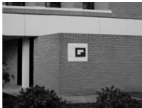
Figure 3: Fiducial marker on a building

When using ARQuake with the GPS/compass tracking less than 50 metres from a building, the poor occlusion of monsters and objects near the physical buildings, due to GPS error, becomes more apparent. As the user moves closer to buildings, inaccuracies in GPS positional information become prevalent. The system is now required to slave the Quake world to the real world, and furthermore in real time. As an example when a user is ten metres from a building their position is out by 2-5 metres, this equates to an error of 11-27 degrees; this is approximately a half to the full size of the horizontal field of view of the HMD. When the error is greater than the horizontal field of view, the virtual object is not visible on the HMD.