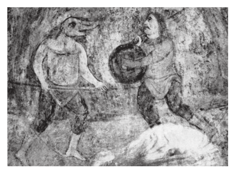
Fig. 6. The fight of the mummers. Fresco on the walls of the stairs of the Northern Tower of St. Sophia's Cathedral in Kyiv.

is devoted to the Catholic icon of Poland of the 16<sup>th</sup>-18<sup>th</sup> centuries, which allows us to understand trends typical for the development of Ukrainian sacred painting in comparison with the development of Polish sacred painting.