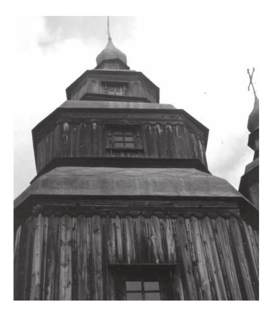
Fig. 4. The use of ornamental water symbols on the eaves of Saint Paraskeva's church in the village of Zarubyntsi (1742).

When the traces of gross fetishism in Ukrainian beliefs were almost entirely erased, there are still enough traces of animism and anthropomorphism ...<sup>21</sup>