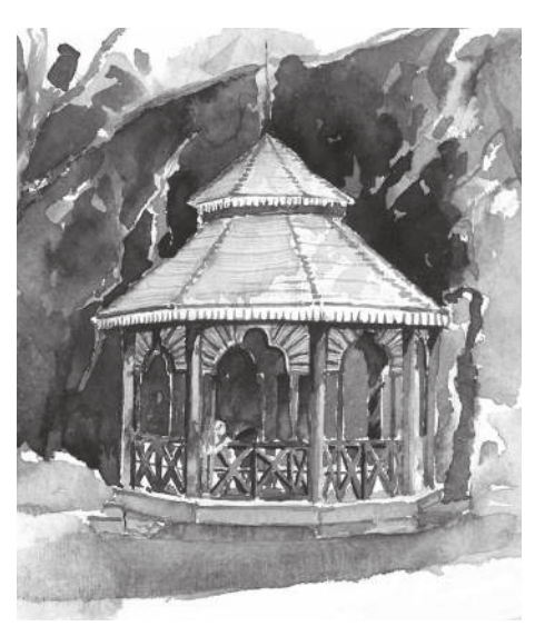
Fig. 2. The Chinese gazebo in Oleksandriia. Watercolour by Chang Peng, 2020.