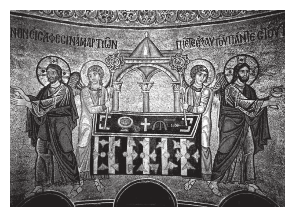
Fig. 5. Eucharist. Fragment of a mosaic in St. Sophia's Cathedral.

of transmitting information through the mural here becomes fundamentally different from the ones used in canonical frescos or mosaics, or even in the gallery of images of noble families' members. As in ancient Chinese pictorial images, commoners are depicted in natural poses, with emotions on their faces. In the fresco "Hippodrome", the artist tries to embody the prospect of space and draws tiers with the boxes for spectators, window shutters and even the rustication of walls in detail (Fig. 7).