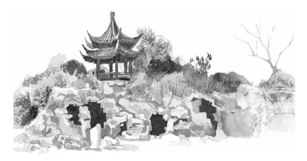
Fig. 1. The gazebo in the garden of Suzhou. Watercolour by Chang Peng, 2020.

In Ukraine, such famous examples of "Chinese" gazebos can be found in the landscape garden of Sofiivka (Uman town) and the historical landscape park Arboretum Oleksandriia (Bila Tserkva town). They reproduced only simplified forms of traditional Chinese landscape gardening architecture (Fig. 2, 3). While comparing such reproductions with the originals, we can easily notice their non-identity. The architecture of small Chinese forms was formed over thousands of years in other climatic conditions. It was influenced by Taoism, Buddhism and Feng shui in compliance with a clear social hierarchy, as well as local architectural and construction traditions that together determined the originality of the silhouettes, the outline of the roofs, fine details and polychrome. However, their European copies did not have a particular philosophical, religious, cultural or artistic foundation that would have been tested for millennia. Therefore, only those elements that the Europeans associated with China at that time were reproduced.