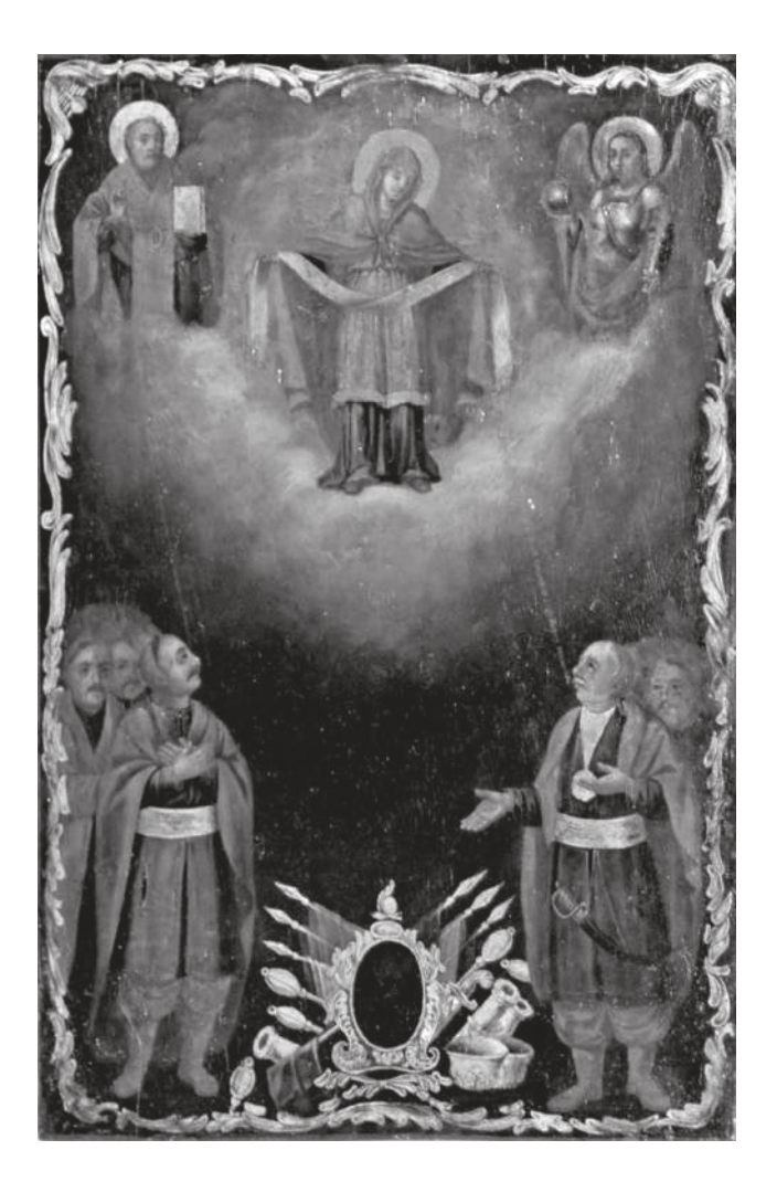
Fig. 8. The Sich icon of "The Protection of the Theotokos" or the "Intercession of the Theotokos" that depicts the last koshovyi otaman (Cossack leader) Petro Kalnyshevsky, a Zaporizhzhia Sich foreman, judge, clerk and others. A copy of 1836 of the original Sich icon, as evidenced by the inscription on the back: "A copy of the old icon located in the Zaporizhzhia Sich and now intact located in the village of Pokrovske which used to be the Sich. A copy of 1836 was written for the Odessa Society of History and Antiquities".

are also borrowed from the Catholic tradition, where real people with their wives and children are depicted under the protection of the Mother of God, Jesus Christ or patron saints.