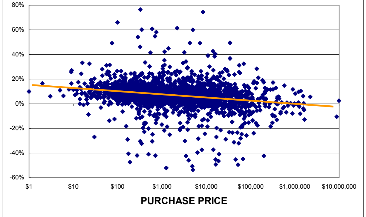
Figure 3: Old Master Paintings Resale Returns