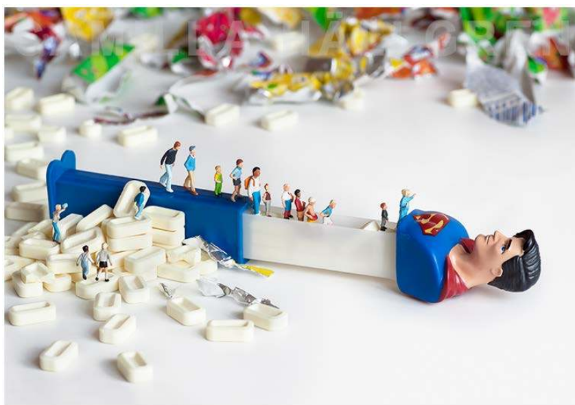
Like peas in a pod www.littleswedenart.com

From socially shaped norms about gender boys will understand what counts as masculine and what is seen as a high or low status masculinity; what is seen as acceptable boyhood-or not. Boys will meet crucial, social obstacles that limit their options to emotionality, operationalized in phrases such as “Big boys don’t cry”. Other norms will separate them from girls and degrades activities and materials marked as feminine (Kane, 2006). Boys will get involved in other, less protecting contexts than girls do. Further, boys are expected to show toughness and to deny pain, weaknesses and illness. They are expected to be successful, adventurous and competitive towards other boys. The masculinity stereotype is about aggressiveness, physical violence and being emotionally restraint. From media images, boys are informed that the ideal male body is large, strong, and muscular. Boys also learn that masculine prestige is about taking risks, driving fast, risk your life, be cool, live fast and die young: Do not be soft, and whatever you do: Do not be a girl! Be a man! Save the world! These stereotyping ideals about being a proper boy are no children’s game. Making a boy identity in relation to a hegemonic masculinity and according to stereotyped ideals could come with a high price, not only for boys, but for society. As explained by Connell (2005) the consequences of these ideals is clearly dangerous, they could even be deadly.