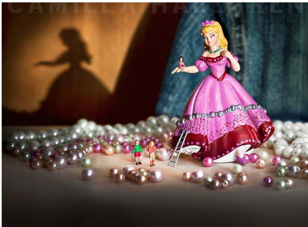
Appearance is everything

One other reasons of children's gendered differences in the experience of being in the world with Others, may be found in the interplay between the Self and the Other, and its associated struggle between being a subject or object in the gaze of others (de Beauvoir, 1949, 2011). As discussed in Hällgren (2013a) de Beauvoir explains that in the making of a feminine identity, there is no actual struggle of being a subject in the interplay between the self and others. Because of the asymmetric power relation between the two sexes, the scene is already set when the feminine self is played towards society and other people. By a socially constructed default, women are pre-defined as the object, and a subordinated correlate to a masculine subject.