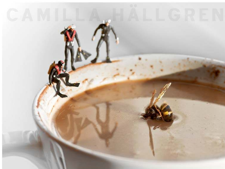
It was clearly dangerous, but for real men quitting is never an option. www.littleswedenart.com

From socially shaped norms about gender boys will understand what counts as masculine and what is seen as a high or low status masculinity; what is seen as acceptable boyhood-or not. Boys will meet crucial, social obstacles that limit their options to emotionality, operationalized in phrases such as “Big boys don’t cry”. Other norms will separate them from girls and degrades activities and materials marked as feminine (Kane, 2006). Boys will get involved in other, less protecting contexts than girls do. Further, boys are expected to show toughness and to deny pain, weaknesses and illness. They are expected to be successful, adventurous and competitive towards other boys. The masculinity stereotype is about aggressiveness, physical violence and being emotionally restraint. From media images, boys are informed that the ideal male body is large, strong, and muscular. Boys also learn that masculine prestige is about taking risks, driving fast, risk your life, be cool, live fast and die young: Do not be soft, and whatever you do: Do not be a girl! Be a man! Save the world! These stereotyping ideals about being a proper boy are no children’s game. Making a boy identity in relation to a hegemonic masculinity and according to stereotyped ideals could come with a high price, not only for boys, but for society. As explained by Connell (2005) the consequences of these ideals is clearly dangerous, they could even be deadly.