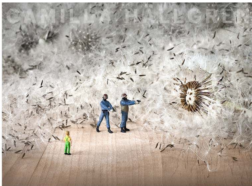
Child is the father of man