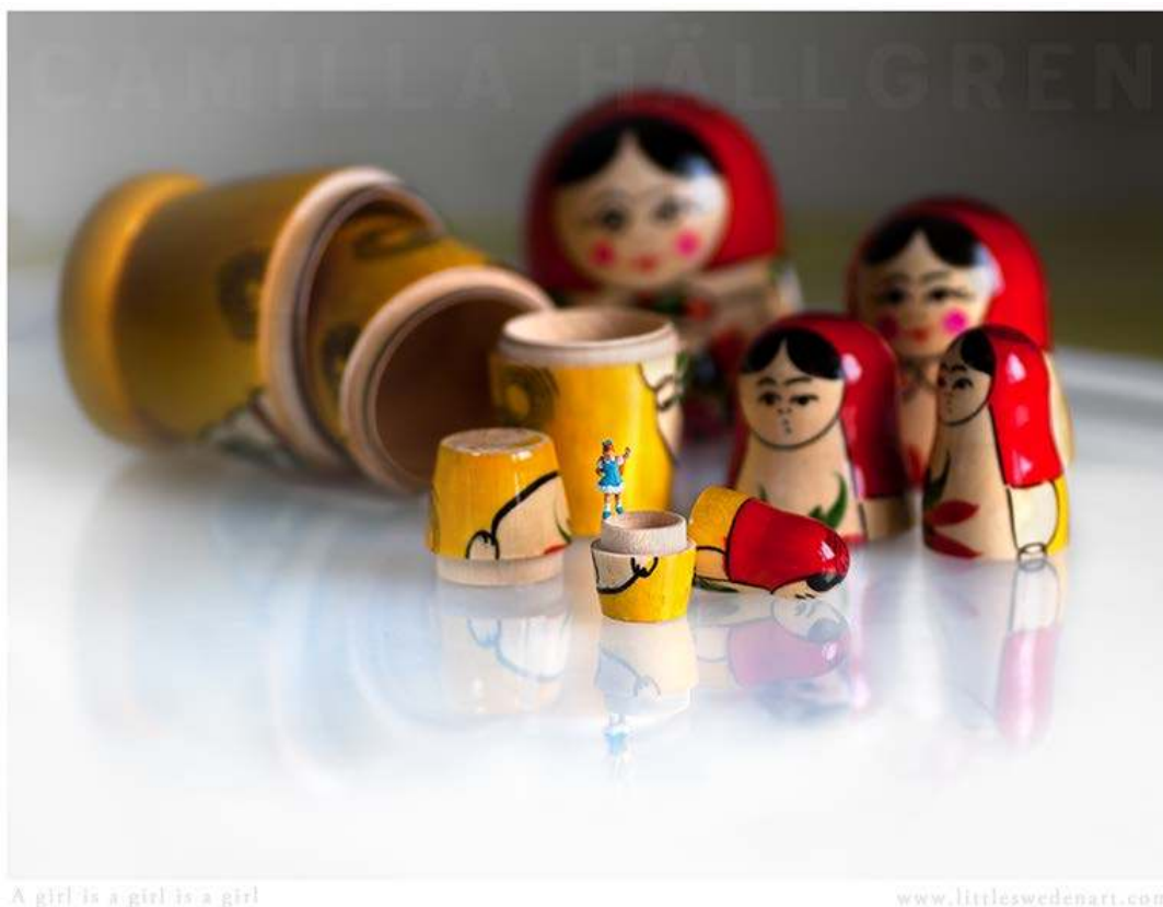
A girl is a girl is a girl

internal experience of measuring yourself in relation to a world that looks on you with a stereotyping or a non-stereotyping gaze (Du Bois, 1903: p. 3).