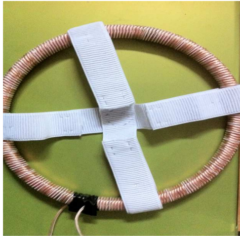
Figure 1- Halo system consisting of 225 turns of 16 gauge stereo wire around a ten inch diameter plastic ring. The toroids were placed around the heads of the stimulus person and the response person who were separated by 300 km.

The experimental procedure was repeated two times. During one sequence of 6 stimulus trains (3 visual, 3 auditory) both participants in a pair received the complex, physiologically-patterned magnetic field. During the other sequence, the participants did not receive any field but received the same 6 stimuli in a different order. One pair of subjects received the no field condition first while the other pair received the field condition first.