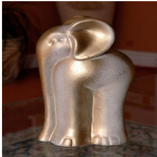
Figure 1: Gold elephant

I always have gold spray in the house and I decided to spray the elephants because they were just cream and they didn't match my candlesticks and I decided to spray them gold, (laughs) (Interview, Ruksana)