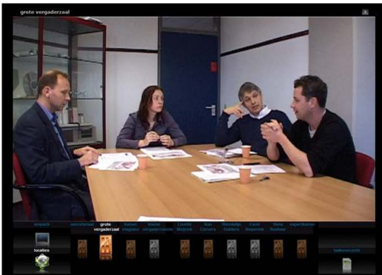
Fig. 3 Screenshot of attending a meeting with experts and stakeholders in the VIBOA game