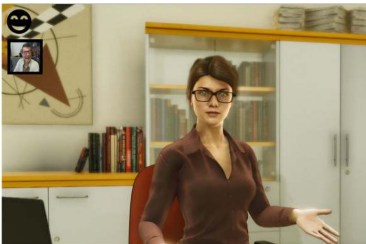
Fig. 2 Direct emotion feedback in the Jobquest application interview game (upper left corner)

The TwoA software component offers a dynamic game difficulty balancing mechanism, which automatically matches the difficulty of the player's task to the player's skill