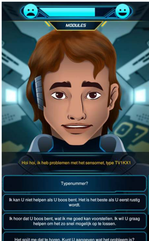
Fig. 4 A screenshot from the Space Modules Inc. game, showing one of the customers

fully load and save its internal state to a JSON file, which may be used for further processing by the game. Although any text editor of choice can be used for authoring, each component included in the role play character comes with a dedicated editor, providing a graphical user interface, syntax error detection and the capability to edit the complex intertwined data structures needed for covering the characters emotions, autobiographical memory, and appraisal rules, among other things.