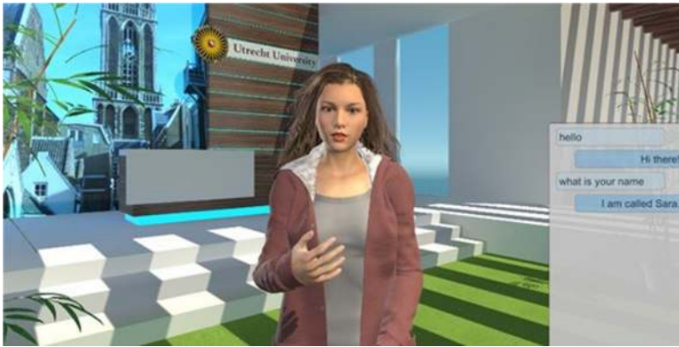
Fig. 5 BML-modelled virtual human capable of speech, gaze and gesture control

behaviour to the sync-point of another. The behaviour planner that produces the BML also gets information back from the behaviour realizers about the success and failure of the behaviour requests.