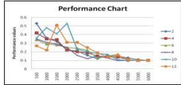
Figure 3: The training performance graph