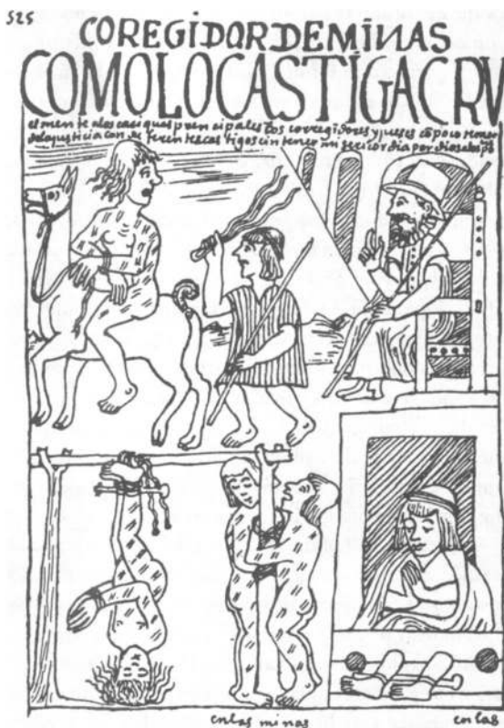
Fig. 3. Corregidor de minas. Catalog of Spanish abuses of indigenous labor force.

In sum, Guaman Poma’s text is truly a product of the contact zone. If one thinks of cultures, or literatures, as discrete, coherently structured, monolingual edifices, Guaman Poma’s text, and indeed any autoethnographic work, appears anomalous or chaotic—as it apparently did to the European scholar Pietschmann spoke to in 1912. If one does not think of cultures this way, then Guaman Poma’s text is simply heterogeneous, as the Andean region was itself and remains today. Such a text is heterogeneous on