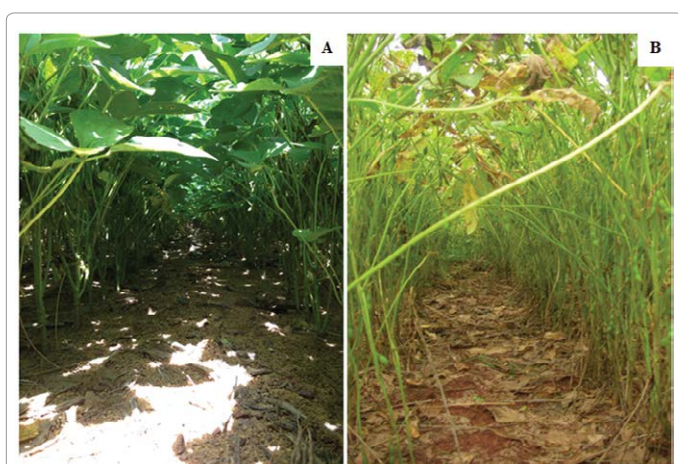
Figure 2: Aspect of soybean canopy with (A) and without (B) fungicide application to control Phakopsora pachyrhizi . It is noticeable the high amount of leaves above ground where the fungicide was not applied. Location of pictures: Campo Verde city, Mato Grosso state, Brazil, February-2010 (W55°16'30"/S15°35'6").

emerged as a domesticated specie by the eleventh century BC. Soybean belongs to the Magnoliophyta Division, Magnoliopsida Class, Fabales Order, Fabaceae Family, Faboideae Subfamily, Glycine genus [23]. Glycine max is a domesticated specie over the 18 known species of the genus Glycine , and its diploid number of chromosomes is forty. Soybean is cultivated in temperate and subtropical regions as oil and protein source.