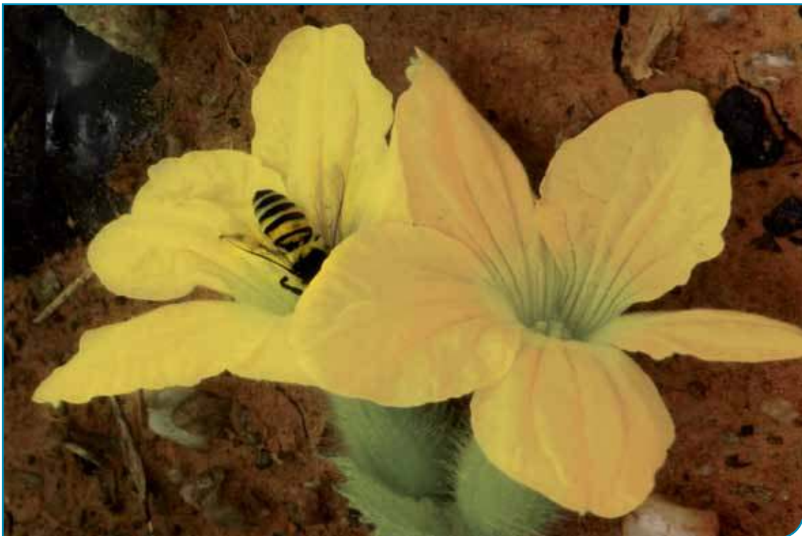
Above: Pumpkin and marrow crops in North and South America are pollinated by specialist wild bees, called "squash bees". Below: Melons, along with other cucurbit crops like pumpkin and marrows, are completely dependent on animal pollinators – such as this honey bee in Brazil – to produce fruit.