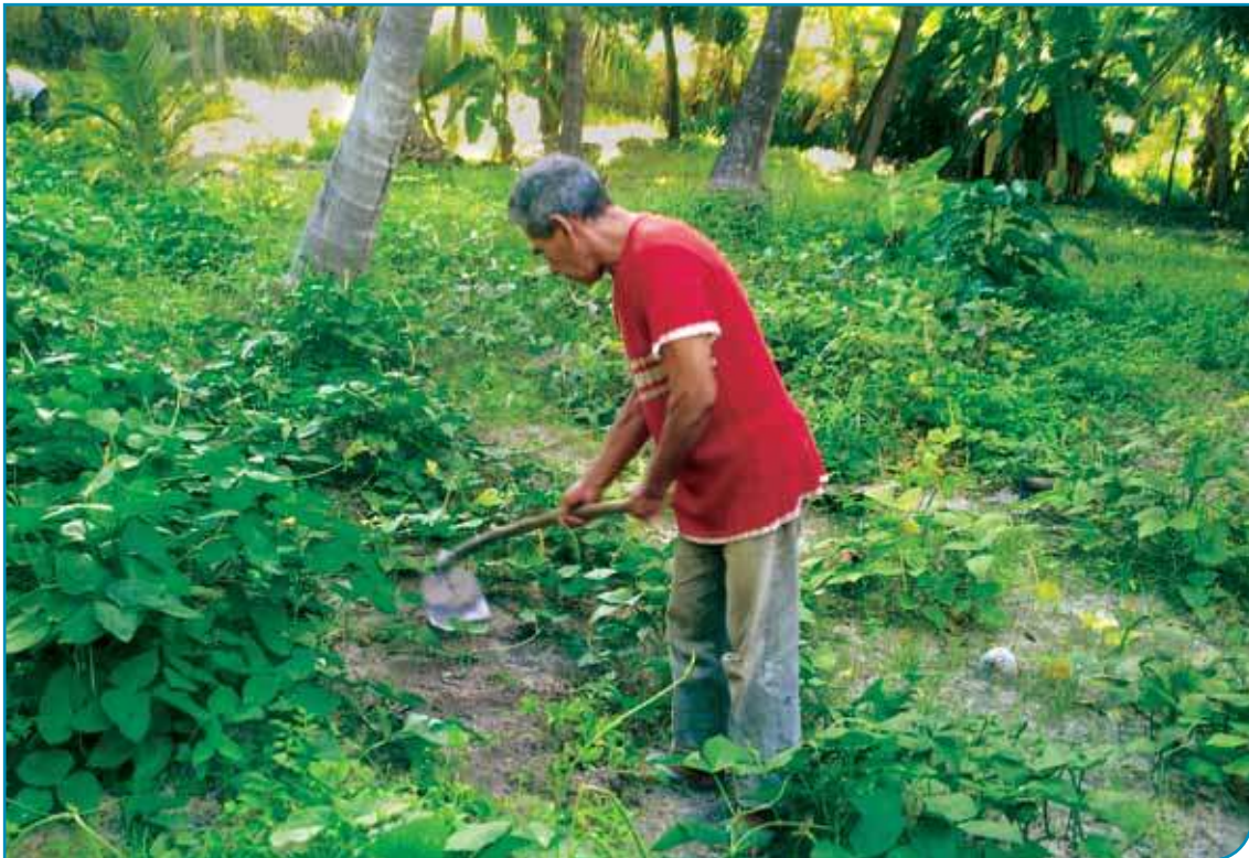
Above: Passionfruit grower in Brazil inspecting his fruit for pests or disease. Below: Smallholder farmer in Brazil removing weeds from his cowpea fields.