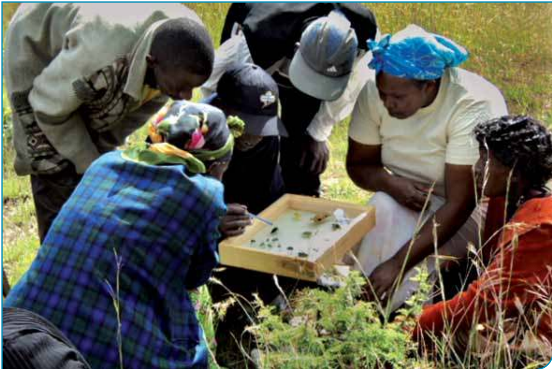
Above: Small-scale horticultural production in Kenya. Below: Kenyan farmers learn about the diversity of insects visiting and pollinating their crops.