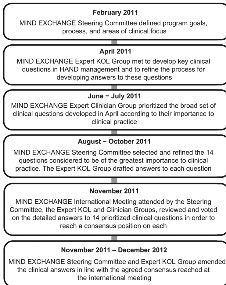
Figure 1. Overview of the Mind Exchange program. Abbreviation: KOL, key opinion leader.

For each question, a draft practical answer was generated by 2 or 3 members of the core expert group based on the findings of the literature review and their clinical opinion. Answers were reviewed by the steering committee and refined by the expert group. Following this, an international meeting with the steering committee, core expert group, and broader HIV clinician group was held to discuss and further refine the draft answers. These 63 participants from 30 countries voted on