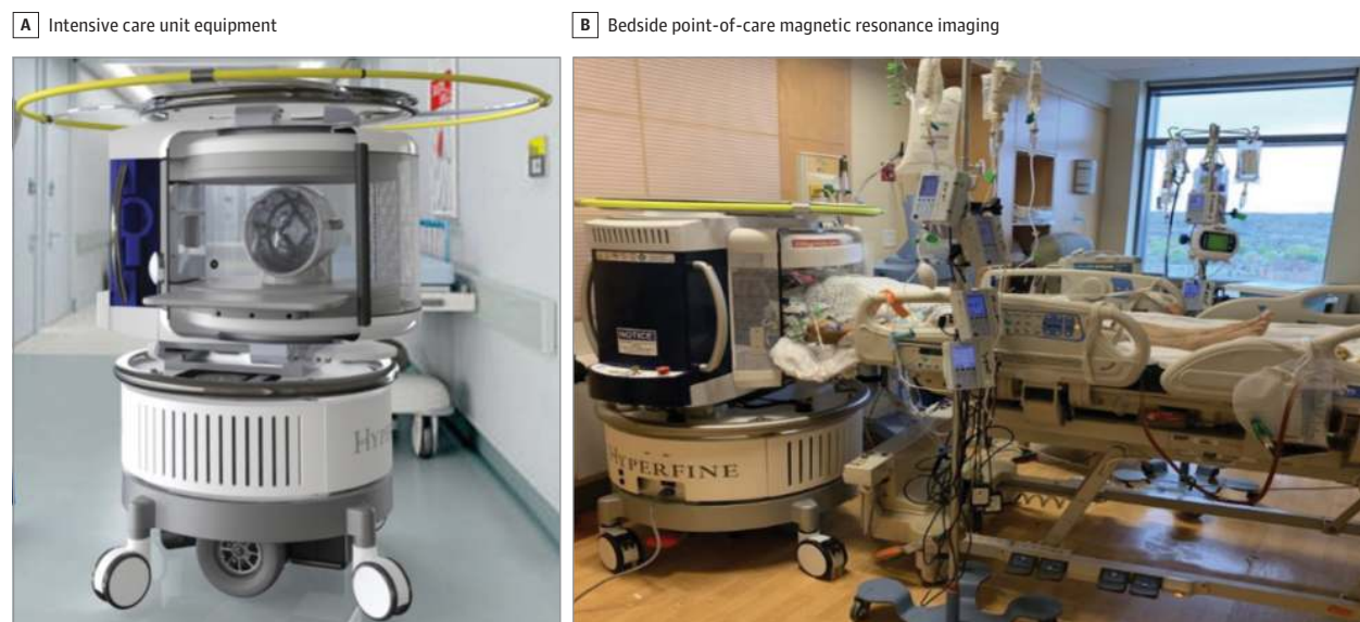
Figure 1. Point-of-Care Magnetic Resonance Images (0.064 T) in an Intensive Care Unit Room

All intensive care unit equipment, including ventilators, pumps, and monitoring devices, as well as the point-of-care magnetic resonance image operator and bedside nurse, remained in the room. All equipment was operational during scanning.