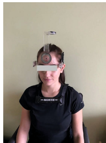
FIGURE 1: Measurement of the range of cervical spine motion using the CROM goniometer.

2.1. Participants. Those eligible to participate in the study were healthy subjects, students of physiotherapy, with no cer-