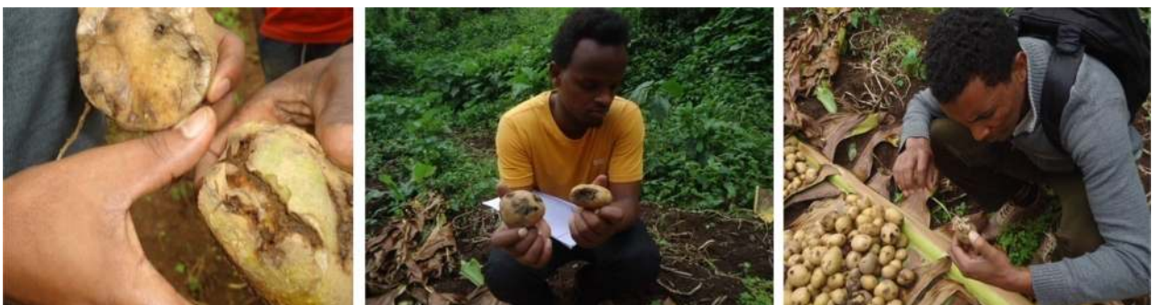
Fig. 8 Sample of potato lost due to disease

The average gross margin with loss (6464.70 Birr) was less than the average gross margin without loss (10,146.12 Birr). This shows that postharvest losses reduce the income of farmers in the study area. The percentage loss of income incurred by the farmers was 36.3%. The average gross margin with loss of local traders, wholesalers and retailers was 282,169.89, 219,644.61 and 345,826.36 Birr which was less than the average gross margin without loss which is indicated in Table 8.