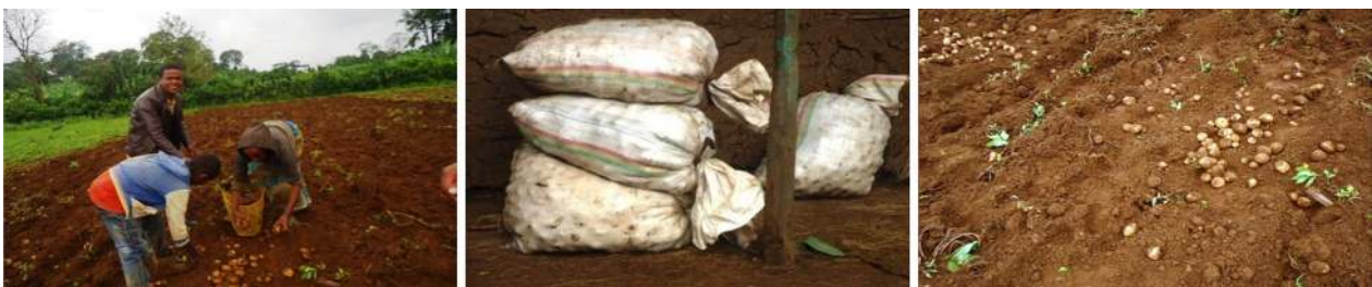
Fig. 3 Harvesting, collecting and storage habit of potato in the study area

The producers in Masha Zone usually stayed their harvested potato without any shade at farm gate for 2–4 days due to low local market demand, and since the area is recognized by its heavy rainfall, the harvested potato was easily spoiled again. They did not cure their harvested product in the sided shade to get a quality product. One of the simplest and most effective ways to reduce water loss and decay during postharvest storage of root, tuber and bulb crops is curing after harvest. The type of wound also affects periderm formation: Abrasions result in the formation of deep, irregular periderm; cuts result in a thin periderm; and compressions and impacts may entirely prevent periderm formation. And also crops are most likely to be injured at harvest by the digging tools, which may be wooden sticks, machetes, hoes or forks. Researchers observed huge amount of potato thrown away or discarded at the farm gate; these all are neither consumed nor marketed in any form (Fig. 4).