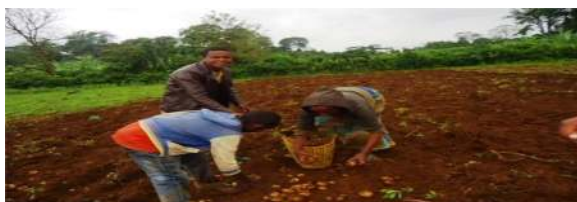
Fig. 5 Selection and grading of potato

The term “storage” as now applied to fresh produce is the holding of produces under controlled conditions. Usually in the study area, producers took the harvested potato to home if they had not get buyers and wait for sometimes until they get buyers and there is a chance to store potatoes for seed for subsequent production period. They place the produce directly on to the soil, especially wet soil, use dirty harvesting or field containers contaminated with soil, crop residues or decaying produce and dirty containers. There was paramount potato postharvest loss occurred due to improper and lack of storing area, insects and worms as well poor handling techniques. There are also situations where commission agents and traders collect potato together in open area around accessible load trucks from producers after bargained