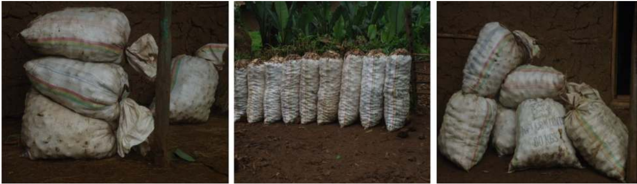
Fig. 6 Storing system in the study area