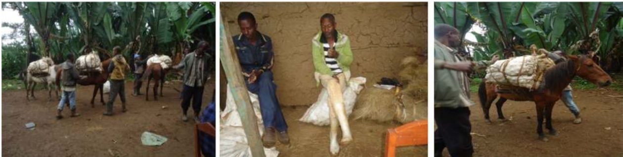
Fig. 7 Potato loading and unloading system in the study area

spraying techniques and the use of cheaper and less effective chemicals. Introducing varieties with some degree of resistance was important, but they still need fungicide applications to control the disease. It has been observed that late maturing varieties tend to have more resistance to late blight than early varieties, but farmers in the study area prefer early maturing varieties. It can be concluded that methods to control late blight are available, but they are not adequately applied by producers with limited resources for inputs and lack of knowledge (Fig. 8).