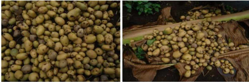
Fig. 4 Discarded potato at the farm gate