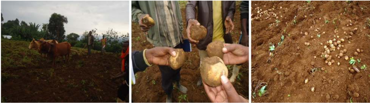
Fig. 2 Harvesting of potato by plowing the cultivated area