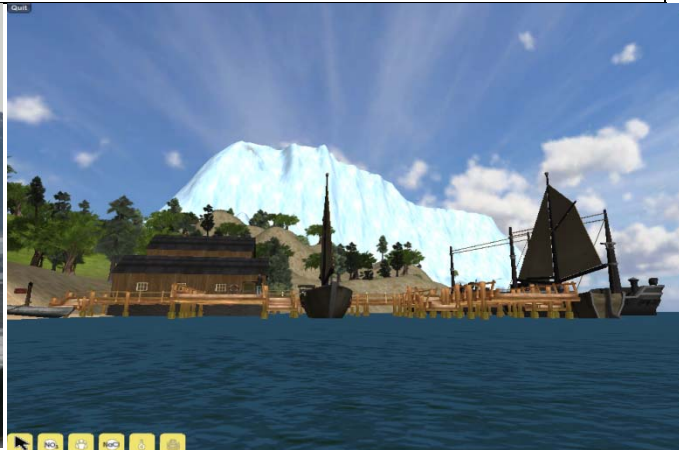
Figure 3: High fidelity virtual assessment