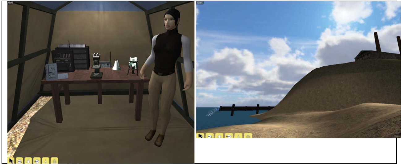
Figure 6: Embedded Performance Palette