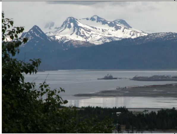
Figure 2: Authentic Alaskan Bay