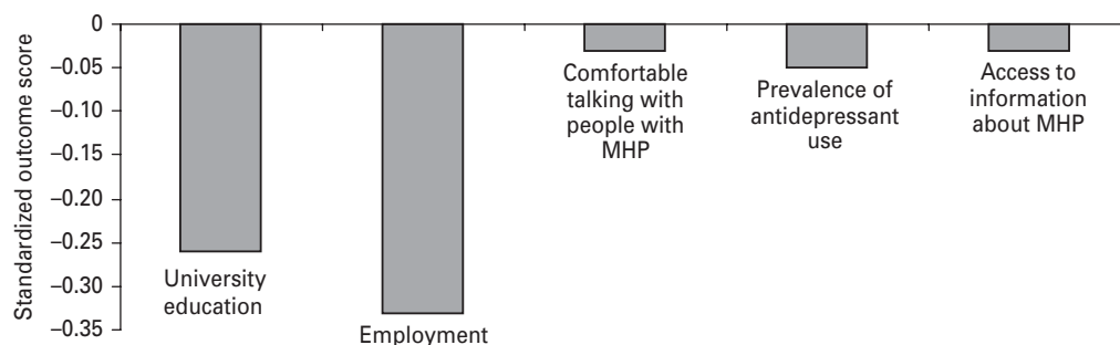
Fig. 1. Significant individual- and country-level predictors of self-stigma as measured by the total standardized Internalized Stigma of Mental Illness Scale (ISMI) score (multivariable linear regression) ( n = 1811 ). MHP, Mental health problems.