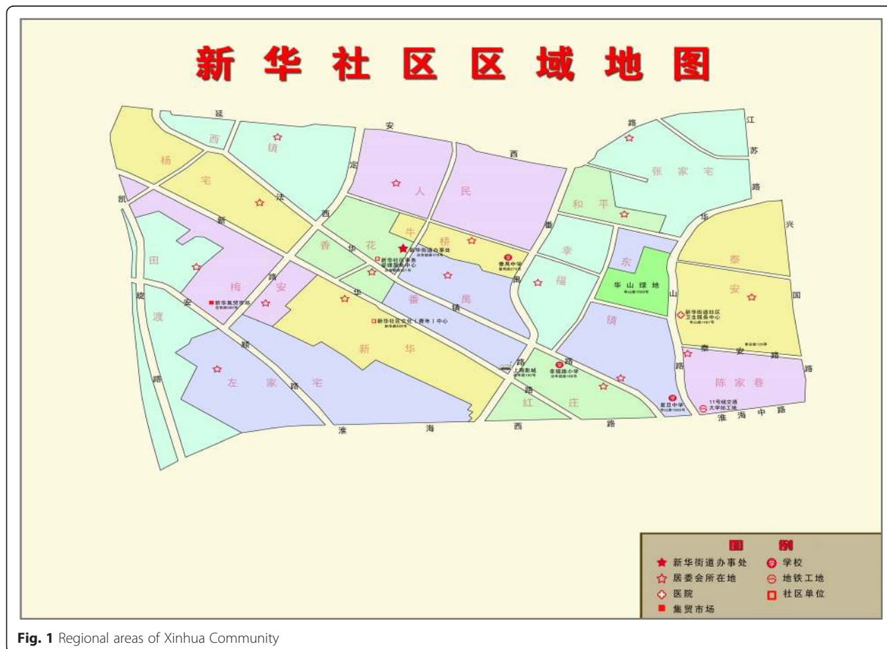
Fig. 1 Regional areas of Xinhua Community

The last 7-day weekly minutes of recreational walking, moderate, and vigorous intensity physical activity were estimated using the Chinese long form of the International Physical Activity Questionnaire [55]. The Cronbach's alpha of items on LTPA was 0.694 for the current sample. According to the previous studies [56, 57], elders was categorized into leisure-time active (LTA) and leisure-time inactive (LTI). Leisure-time active refers to at least 150 min of leisure-time physical activity per week. This criterion is in