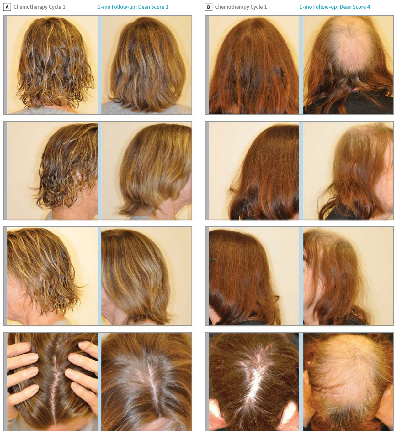
Figure 2. Photographic Results of 2 Patients Treated With Scalp Cooling

A, Patient photographs from 4 different angles before the start of chemotherapy cycle 1 (Dean score of 0; hair loss of 0%) and 1 month after completion of 4 cycles of chemotherapy with docetaxel (60 mg/m 2 ) and cyclophosphamide (600 mg/m 2 ) (Dean score of 1; hair loss >0%–≤25%). 8