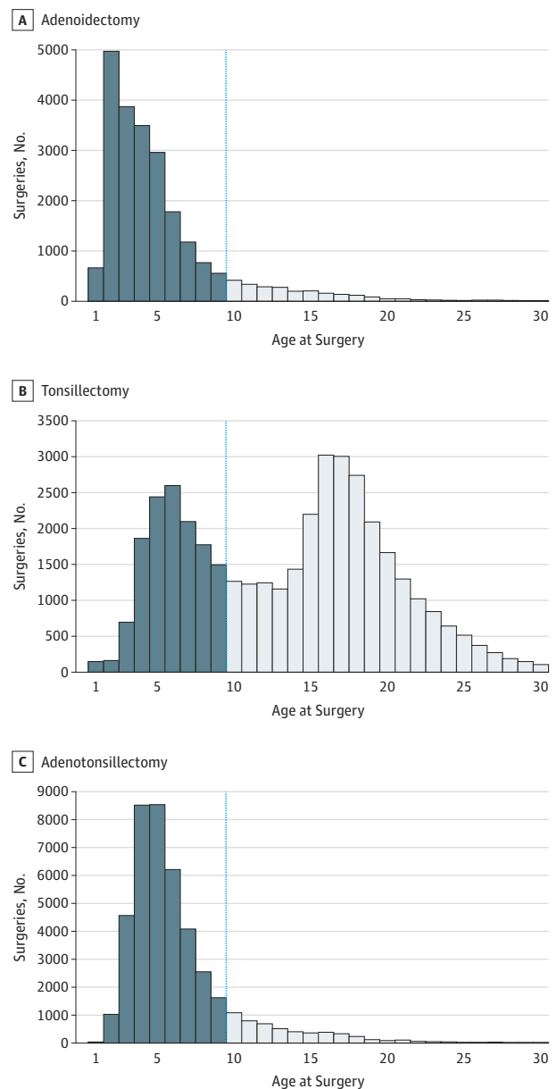
Figure 1. Age at Adenoidectomy, Tonsillectomy, and Adenotonsillectomy for 1 753 100 Danes Born Between 1979 and 2009 and the Selected Surgery Observation Window of 9 Years

This cut-off for inclusion as surgery cases (dark blue bars) was deemed optimal because the first decade of life is critical for normal immune system development, it represents most of the period in which these surgeries are usually performed, and maximized the number of years available for disease follow-up after surgery. For tonsillectomy this meant that we ignored a second peak at approximately 16 to 17 years because inclusion of these surgeries would have implied insufficient time for follow-up (to 30 years). Our study thus explores the impact of the 3 types of surgery when performed during childhood rather than adolescence. Individuals with these surgeries beyond the 9-year observation end point (dotted vertical line) were not included as either cases or controls. Individuals were also excluded if they had multiple surgeries at different ages, ie, some individuals underwent adenoidectomy followed by tonsillectomy years later or vice versa. Such cases were rare in the sample (<0.2%).