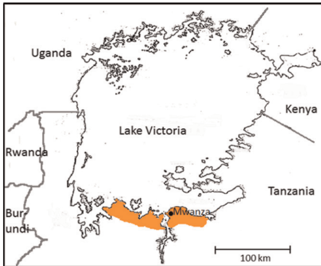
FIGURE 1. Lake Victoria, surrounding countries, and the Mwanza study area (shaded).

testing at the laboratory of the National Institute for Medical Research (NIMR) in Mwanza, Tanzania. Venous blood was also collected, and serum was separated and stored at -20^{\circ}\text{C} at the NIMR laboratory. Testing for syphilis and preparation of a portion of CAA test strips were performed at NIMR. Additional test strip preparation and all test strip reading were performed at the Leiden University Medical Center.